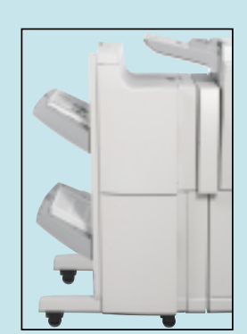
Two-Tray Finisher (AR-F11)